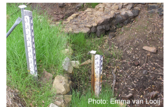
Staff gauges at the catchment sampling site.