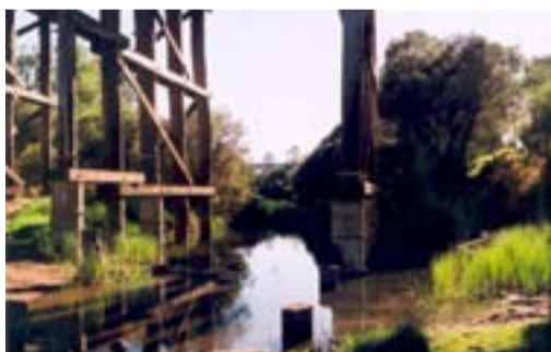
Great Northern Highway bridge, January, 2003.

Water quality samples are collected at the Avon River's lower end near the Great Northern Highway to indicate the nutrients leaving the catchment. Note that the values determined may not represent nutrient concentrations in upstream tributaries. Flow is measured at the Department of Water gauging station located just downstream of Walyunga National Park.