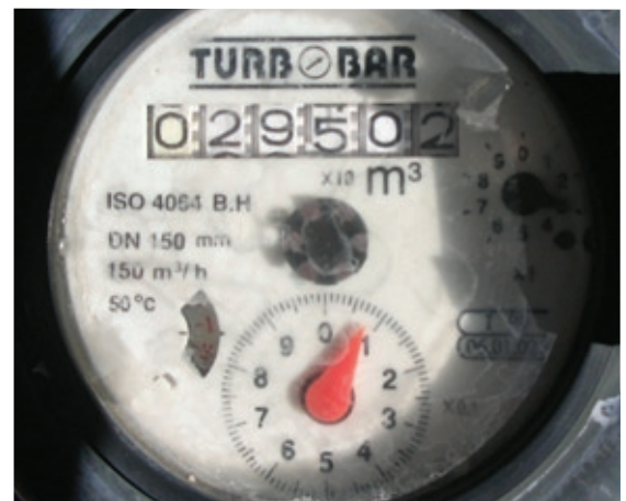
Bermad Turbobar X10 meter Meter Reading 295 020 kL