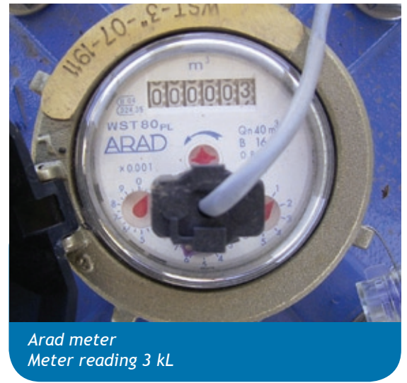
Arad meter Meter reading 3 kL