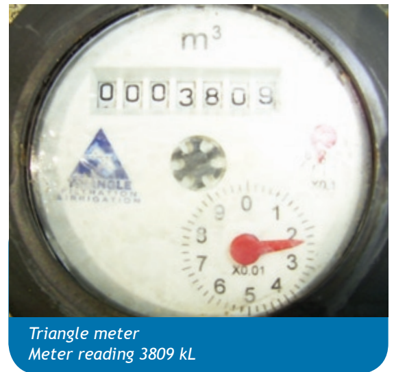
Triangle meter Meter reading 3809 kL