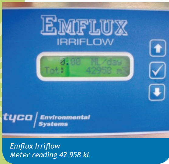
Emflux Irriflow Meter reading 42 958 kL