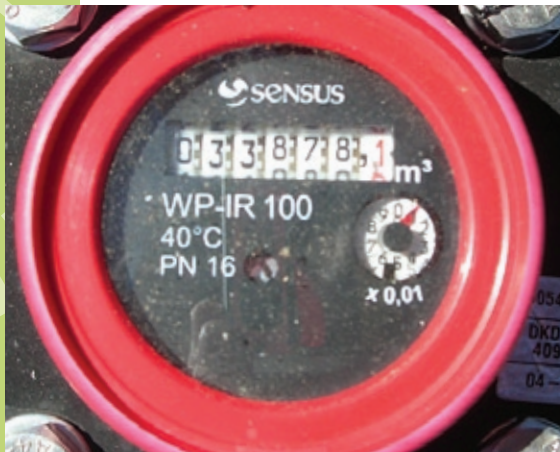
Meinecke meter Meter Reading 33 878 kL

Meter water use cards can be downloaded off the internet at www.water.wa.gov.au/gnangara/metering under the How to read your meter section. You can also contact the metering team and we can arrange to have one sent to you.