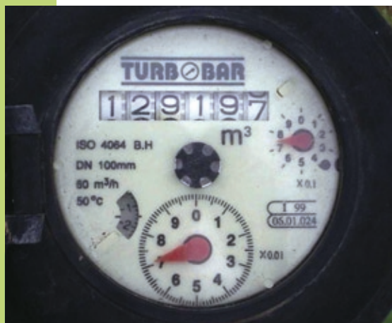
Bermad Turbobar Meter reading 129 197 kL