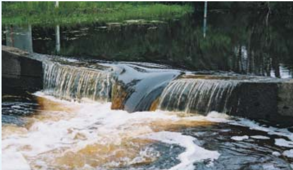
Kompup gauging station.

The final step would be to implement this plan and to recover a major river from salinity — a national first!