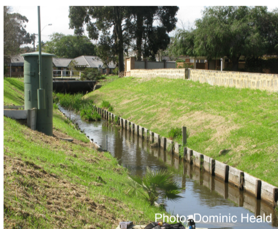
Bayswater Main Drain at the gauging station, August, 2012.