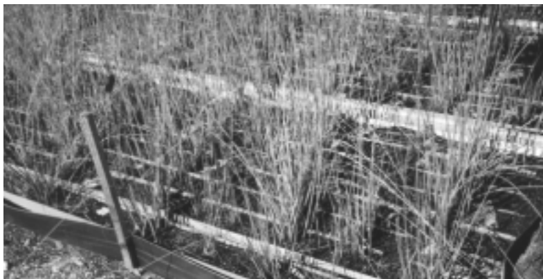
Schoenoplectus validus (Lake Club Rush) being grown in strips ready for planting.

This group consist of three sub-groups, Schoenoplectus , Isolepis and Bolboschoenus . All are totally different from each other, but all carry nuts in groups of spikelets on the stems.