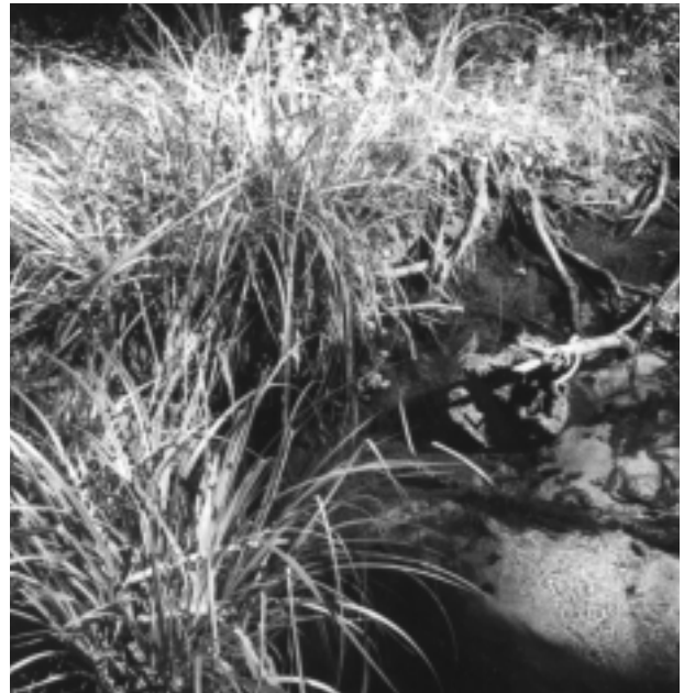
Recently planted Carex fascicularis (Tassel Sedge) stabilising the banks of Bennett Brook.

Carex divisa is common on the Swan Coastal Plain down to Bunbury, and looks very similar to Carex inversa . It is a rapid rhizome spreading species which can be difficult to control.