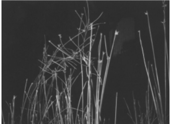
Cyperus gymnocaulis showing new plantlets sprouting from the seedheads.

There are a large number of weed species in this family.