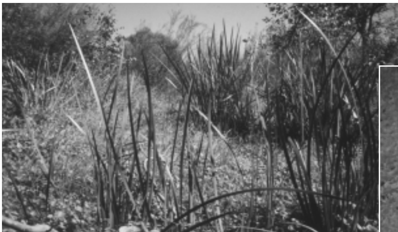
Baumea preissii growing in a field of Centella asiatica on the edge of Bennett Brook.