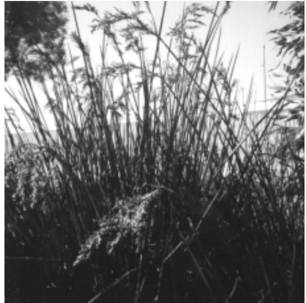
Lepidosperma tetraquetrum - 4-angled sedge.

The Lepidosperma family is quite large, and many of the species are bushland plants. All species have nuts which are held in bunches of spikelets on the stem, and most have wide flat leaves and stems of varying widths. Most species are clumping, with one which spreads rapidly from rhizomes. Most of the species produce little viable seed.