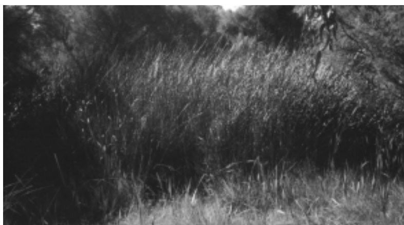
A thick stand of Baumea articulata (Jointed Twig Rush) on the edge of Bennett Brook.

A diverse group, which all look different from each other. Most are rhizome spreaders, with some spreading faster and further than others. Seeds are large nuts held in numerous spikelets, up to 2mm long.