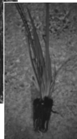
A cell of Baumea preissii