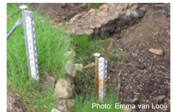
Staff gauges at the catchment sampling site.