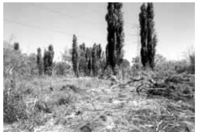
Chilean Willows have spread along Bennett Brook L. Taman in Caversham.

The use of large machinery to remove deciduous trees can result in damage to other flora and to the banks and floodplains of streams and rivers, and should be considered carefully. Mechanical removal is best for the smaller willows such as Chilean Willows, which are shallow-rooted and can be completely pulled out using a vehicle and chain. Care must be taken however to ensure that all broken branches are removed from the site before they take root and resprout.